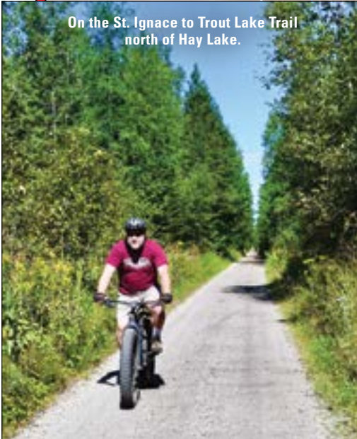
On the St. Ignace to Trout Lake Trail north of Hay Lake.